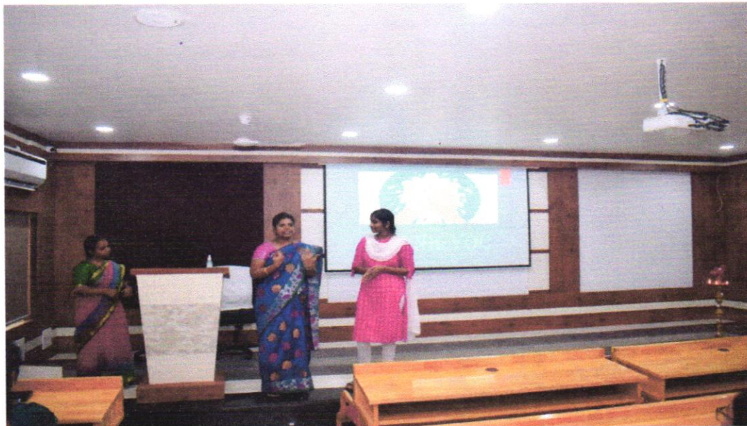
Fig 4: Demonstration of hand rub