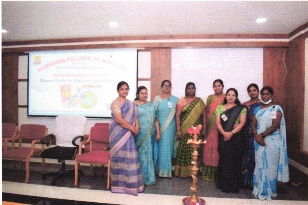
Fig 2: Faculty were starting the program with lamp lighting