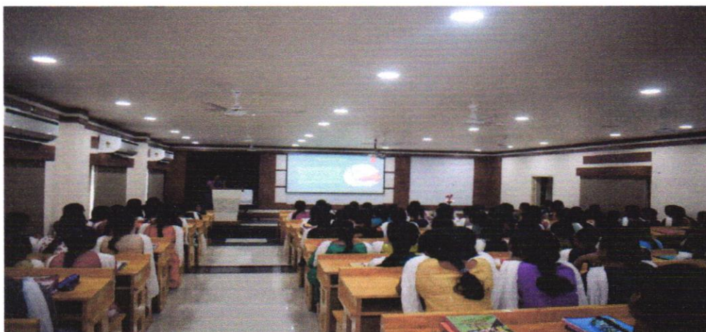
Fig 3 : Presentation on hand hygiene practices